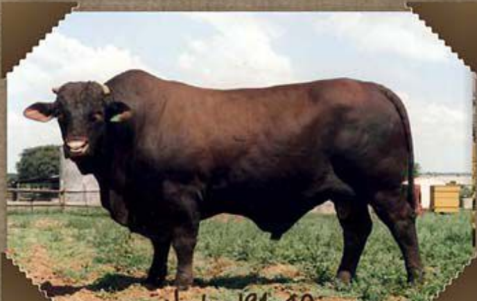
Jochar191-40 (Toffie x Sombrero Jeff)