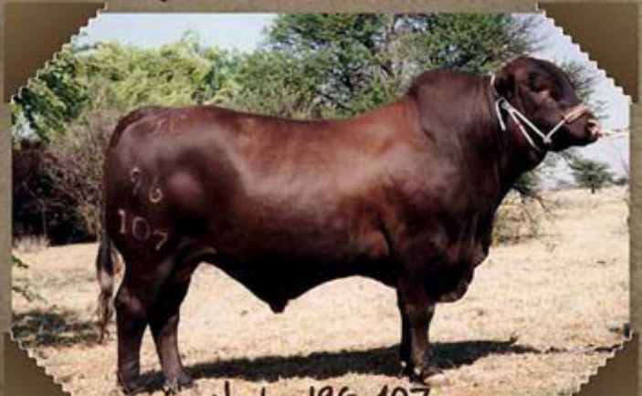
Jochar196-107 (Galga West Barry)

23 RD SALE 16 August 2017 | Delareyville