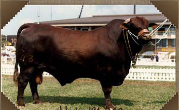
Jochar191-043 (Toffie x Sombrero Jeff)